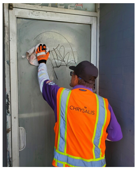
Chrysalis clean team removing grafitti tags