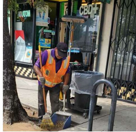
Chrysalis clean team sweeping trash